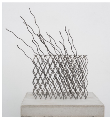
Growing I, 2025

Maren Hassinger displays her signature materiality in the form of wire rope and twisted paper, continuing her work in the transposition of the natural world. From early on in Hassinger's sculpture, references to nature are frequent, as seen in works like River (1972), Rain (1974), Twelve Trees (1978,) and Beach (1980). Such titling suggests a deep resonance with nature, yet the materials employed in all of these works are distinct in their evidence of the human hand: steel chains, rope, ink on paper, plaster, and, of course, Hassinger's signature twisted wire cable. The story is told best by Hassinger herself: