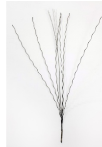
Wall Compositions III, II, V, and VI, 2025