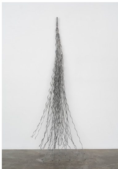
Falls II, 2025

Hassinger also employs an integral part of her practice in the form of weaving, using rigid materials and structural techniques that belie the aqueous, malleable nature of wind and water. Wire-rope sculptures Falls I and Falls II hang from the wall, bundled at the top much like brooms of yore, sans stick, and unravelling as they descend, emulating the shape of their namesake. These sculptures are modular, units of these wire rope bundles able to be added ad infinitum, per the space available where they are installed. An impressive grouping of eleven dominates one wall, while a more approachable grouping of seven hangs on another, a nod to the infinite potential of the work's final form.