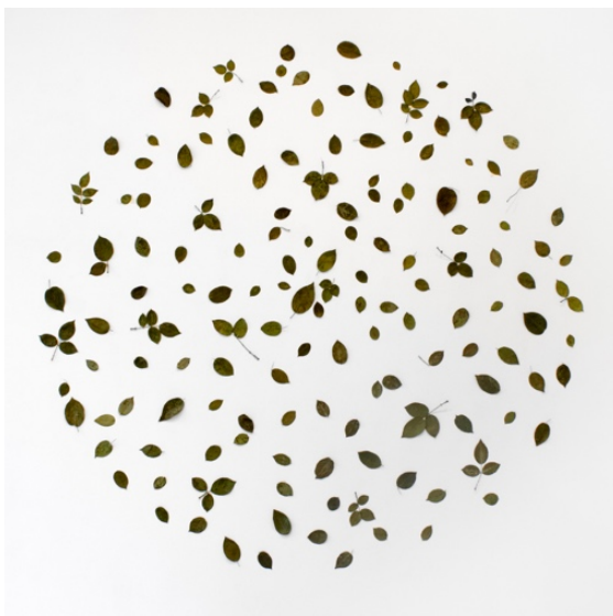
Rose Leaf Composition, 2025

In a final address of nature's cyclical movements, the work that both greets and bids farewell to visitors of the gallery is comprised of preserved rose leaves. Rose Leaf Composition (2025) is a radial installation, visually recalling how fallen foliage appears on the surface of a body of water. Hassinger lengthens the life of these leaves with a formula concocted during a residency at the Studio Museum in Harlem, a poetic ode to nature's ephemerality. The leaves bud, blossom, and yearn to wilt, and only an artist's intervention freezes them in stasis, bidding them to hold on a bit longer. This mirrors Hassinger's concern for our effect on the world around us, positing that since we cannot reverse the damage we have done, we can, and must, at the very least,