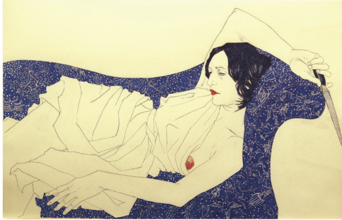
Hope Cangloff "Salomé", 2009. Ink/clay-coated paper, 25 1/4" by 37" / 27 3/4" by 40" by 1".