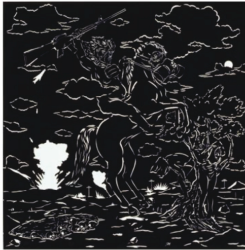
William Villalongo "The Wild, Wild West!" 2007. Velour paper, 39" by 39" / 42 1/2" by 41 3/4".