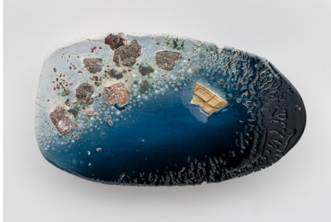
Liz Larner, vi (calefaction) , 2015. Ceramic, glaze, stones, and minerals, 36.6 x 21 x 7.5 inches (courtesy of the artist and Regen Projects, Los Angeles)

Packard, Cassie, "Your Concise New York Art Guide for February 2022." Hyperallergic , 1 February 2022.