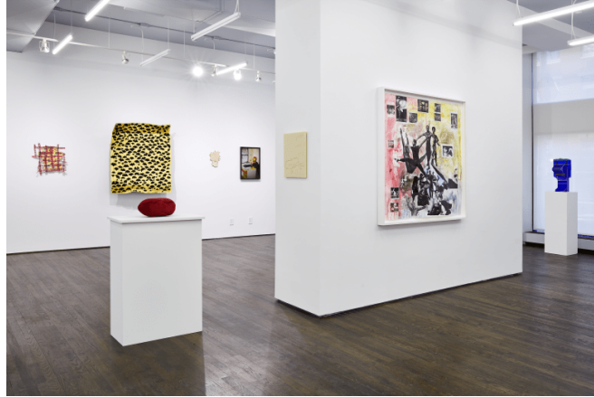
Installation view, Looking Back / The 12th White Columns Annual – Selected by Mary Manning, White Columns, 2022

Packard, Cassie, "Your Concise New York Art Guide for February 2022." Hyperallergic , 1 February 2022.