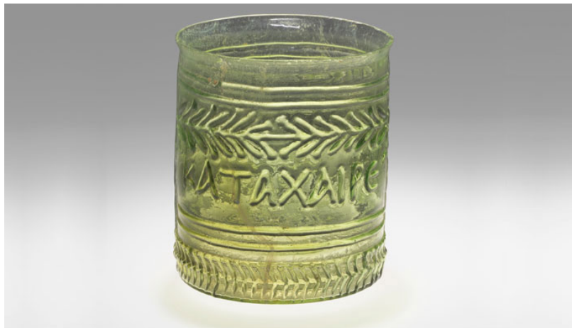
Beaker with inscription, 1st century A.D., Roman, Eastern Mediterranean. Glass.