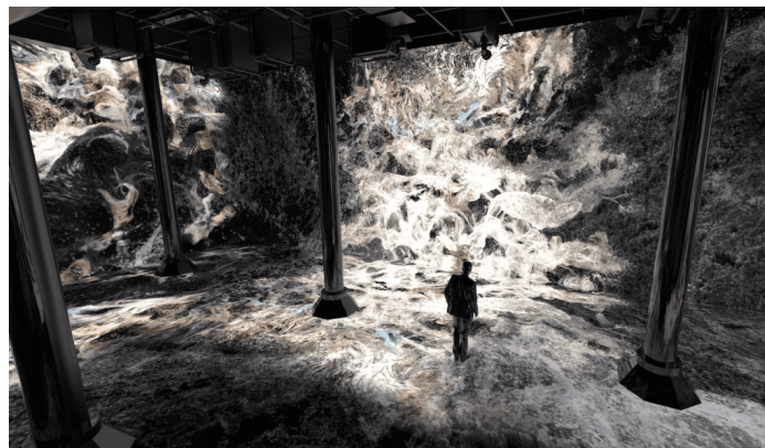
"Trust" by fuse* at Artechouse, New York. Photo by Artechouse, New York.