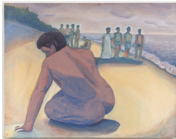
Dylan Hurwitz, Clique (Herring Cove) , 2021

10. "Dylan Hurwitz – Pathways: Herring Cove" at Freight and Volume , New York