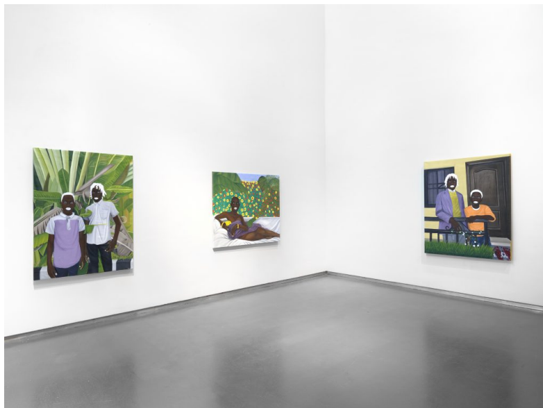
Let There Be Light, Let There Be White, Installation View