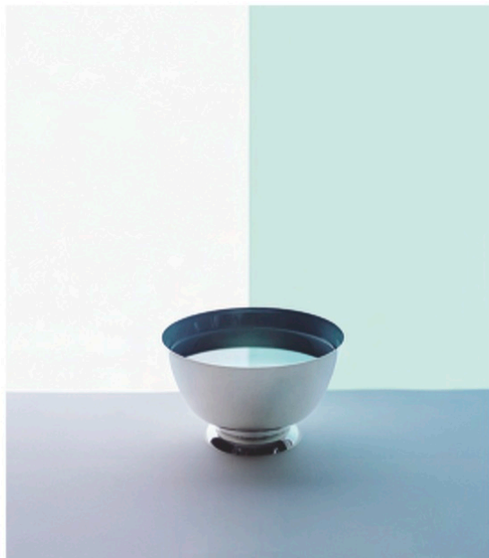
From left: SARAH CHARLESWORTH, Rietveld Chair, 1981. Black and white mural print, mounted with lacquered wood frame, 173 cm x 127 cm; Half Bowl, 2012. Fuji Crystal Archive Print, mounted and laminated with lacquer frame, 104 x 80 cm. Both courtesy the artist and Susan Inglett, New York.

can create something that is seamless, but I often find that is not an easy image to enter. I appreciate process. Photography can be a very self-reflexive medium. If I am constructing an image or a sculpture, I like referring to the fact that, in its capture or its installation, it is a conflation of two and three dimensions.