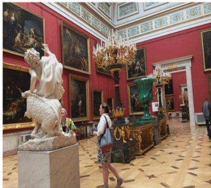
(T) Pavilion Hall Hermitage Museum, St. Petersburg (B) Italian art gallery Hermitage Museum, St. Petersburg