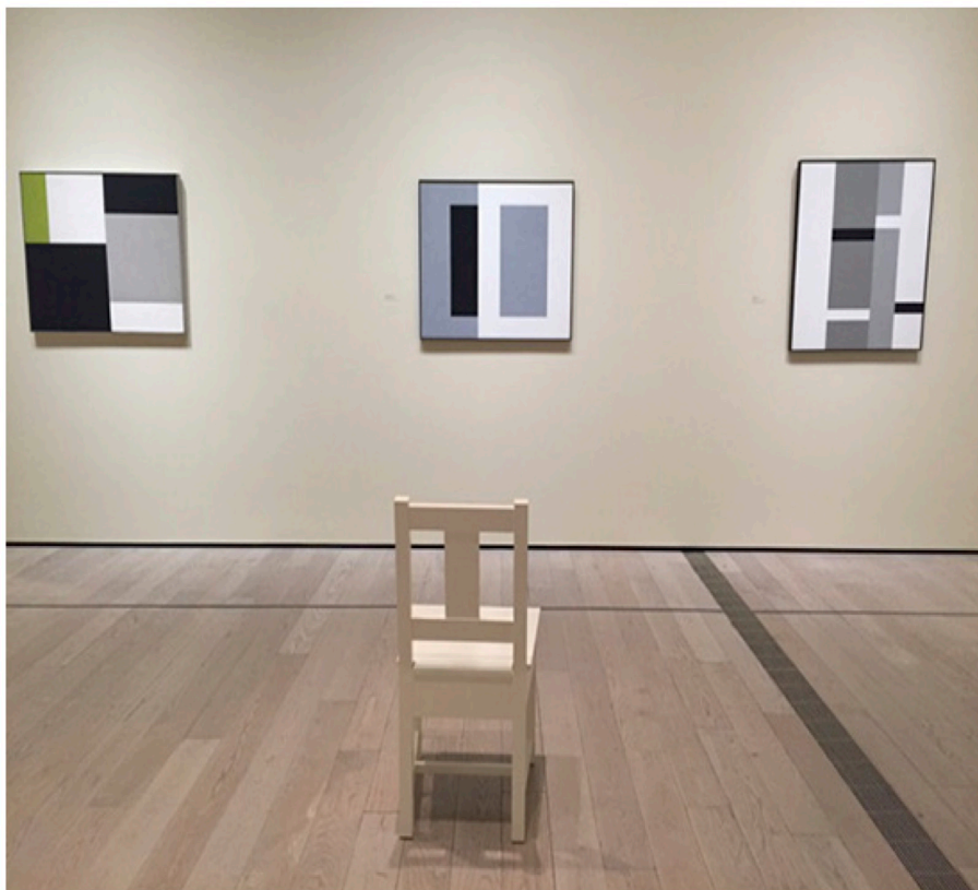
Installation shot of the exhibition under review including, far right, Untitled, 1955, 1955. Oil on Masonite, 38 x 32 inches, discussed in this review.

The recent presence in New York City of the purist abstraction of artists such as Agnes Martin, Mark Rothko, Carmen Herrera, Joseph Albers, not to mention the artists of the Paths to the Absolute exhibition at Di Donna (Kandinsky, Malevich, Mondrian, Newman, Pollock, Rothko, Still) suggests that the zeitgeist is ripe for a full examination of the work of John McLaughlin, too. McLaughlin (1898-1976) sought, both in his paintings and writings, to provide a rationale for abstract art that eschewed the