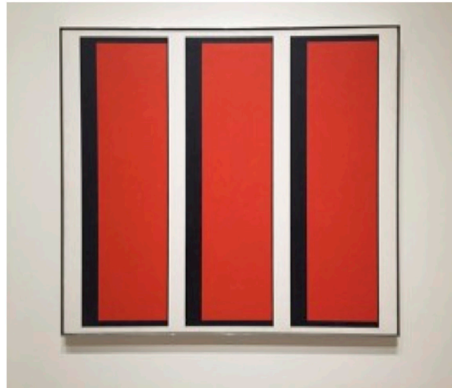
John McLaughlin, #1-1968, 1968. Acrylic on canvas, 48 x 60 inches. Collection of Beth Rudin DeWoody.

Untitled (1955), included in a large room of close to a dozen asymmetrical works from the 1950s, has an overall calming effect. At first glance, it appears to be balanced and harmonious with several contiguous rectangles in soft grayish earth tones near its center and large white areas on each side. With continued looking, one's eyes begin to jump around, noticing the two narrow black bands or the two narrow white ones jutting out from the white side sections and piercing the earthy middle sections. One may wonder why the two vertical white areas surrounding the middle bands are not the same size, or why the narrow white bands on the right and left appear to thrust themselves into the center of the painting. Surprisingly, the painting manages to maintain both its original harmonious calmness and its visual challenges—in sequence, but not simultaneously. In the next room, there is a majestic symmetrical painting, #14 (1959) featuring two large void-like rectangles in light blue and deep black to offer a place of contemplation for the viewer. It soon becomes apparent that whichever large form one focuses upon is the one that appears to move closer to the viewer. But before long, the quiet contemplation shifts to more active problem solving as the horizontal blue rectangle at the bottom edge of the painting appears to cause the larger forms to rise.