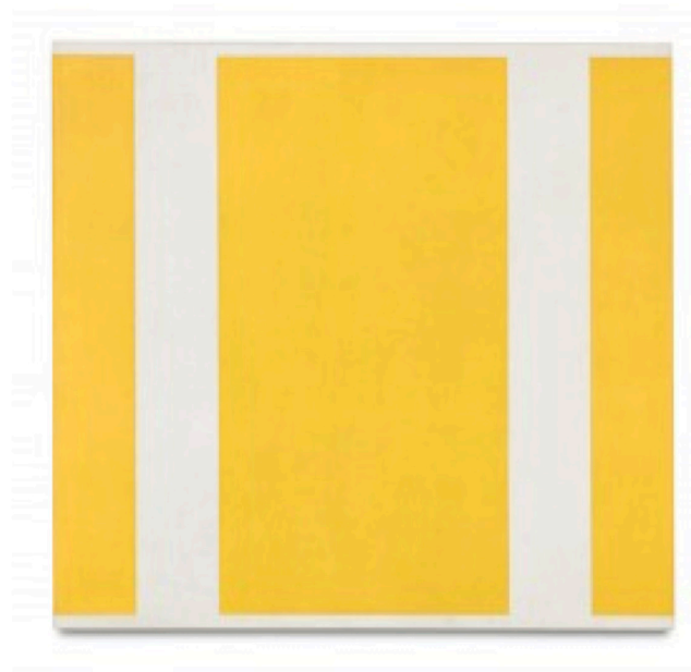
John McLaughlin, #4-1965, 1965. Oil on Canvas, 48 x 60 inches.

Nevertheless, seeing a John McLaughlin exhibition is stimulating as well as meditative. Initially, the paintings have a calming effect brought about by their strong sense of balance and harmony. Being in their presence for a while begins to reveal some unexpected tensions and visual surprises, however, that set one's eyes and thoughts in motion. This is paradoxical, as meditation and visual stimulation are typically considered to be mutually exclusive or at the very least, incompatible. It is McLaughlin's ability to harness this paradox that helps to explain what makes his work so satisfying and significant.