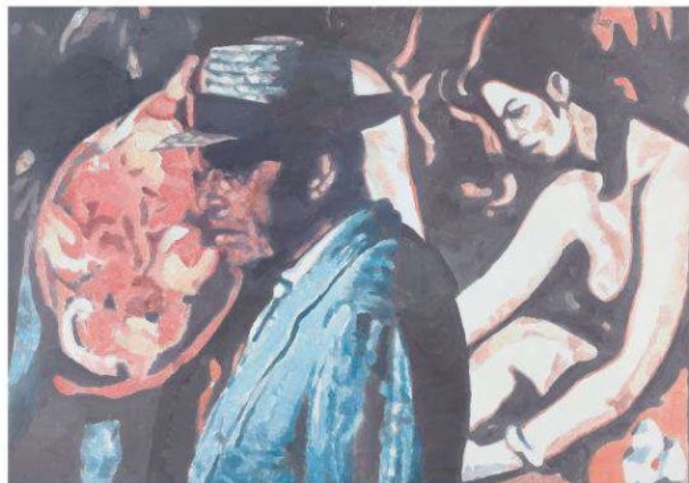
ABOVE: Keren Cytter Vengeance (working title), 2012. HD video, 20 min.