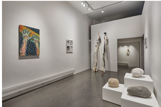
Galleria Anna Marra, view of the exhibition

At the contemporary art gallery Anna Marra a group show crosses interior landscapes, urging on social, political, cultural and intimate themes