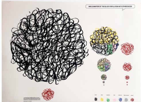
William Villalongo and Shraddha Ramani, from "Printing Black America: W.E.B. Du Bois's Data Portraits in the 21st Century." (Photo courtesy of the artists)

In 1896, the U.S. Supreme Court, with its decision in Plessy v. Ferguson , established the "separate but equal" doctrine and enshrined racial segregation into law. Just a few months later, sociologist W.E.B. Du Bois began a study of Black life in Philadelphia — the first in a series of groundbreaking books that would demonstrate the hollowness of the court's reasoning.