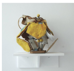
GREG SMITH Beards (Jack-in-the-box Shoe) , 2010 wool, wood, plastic and shoe 14 x 14 x 14 in (GSM0019)