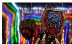
GREG SMITH Bearded , 2010 DVD running time 11.10 minutes Edition of 5, 1 AP (GSM0016)