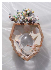
GREG SMITH Beards (Untitled) , 2010 Resin, enamel paint, caulk, vinyl, plexiglas, hardware, plaster, papier-mache, copper, wood, pastel, urethane and hardware 40 x 26 x 16 in (GSM0020)