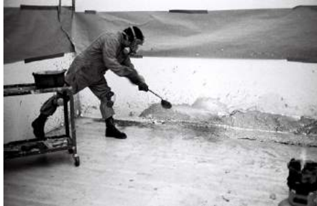
Richard Serra's "Gutter Corner Splash: Night Shift".