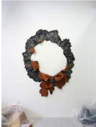
Brie Ruais, Inside Peeled Out , 132 lbs of Terracotta, 2013.

Cowansage, Corydon. "Interview with Brie Ruais," Art Haps.com , 27 October 2013.