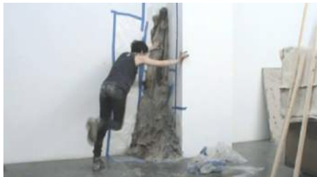
Brie Ruais, Nobody Puts Baby in the Corner (Big Push in a New Space) , Video Still, 2012.

making it. But I wouldn't show the video documentation of recent pieces because they seem hyper-sexual. The piece at the Horticultural Society isn't sexual in the same way, I think. It reads as more aggressive.