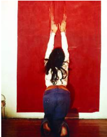
Ana Mendieta, "Untitled (Body Tracks)" (1974), Lifetime color photograph. ©Estate of Ana Mendieta Collection, Courtesy Galerie Lelong, New York.

BR: I don't intentionally place the body impressions that are in the work, but I do make formal decisions to tear a piece open in the shape of an O or X. Breaking through the clay that I've spread on the floor is where, for me, the material stands in for the body and landscape. I'm inspired by the way that Ana Mendieta's work conflates violence, the body, and the land.