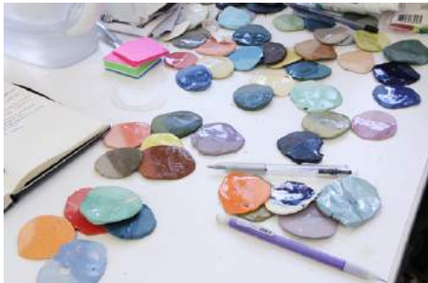
Pigmented ceramic tests, Brie Ruais' Studio, September 2013.

Cowansage, Corydon. "Interview with Brie Ruais," Art Haps.com , 27 October 2013.