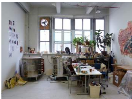
Brie Ruais' Studio in Sunset Park, Brooklyn. September, 2013.

In the last week of September I visited the Sunset Park studio of Brie Ruais as she prepared for her first solo show at Nicole Klagsbrun's pop up space . Ruais works with clay, creating large, gestural reliefs that reference both the body and the landscape. Her current work is the result of a very physical, performative process. She uses her own body weight, and sometimes that of a collaborator, to sculpt a comparably-sized mound of clay—pushing, kneading, and spreading the material. The ensuing pieces act as a record of these actions, and sometimes document behaviors in a given space itself. During the studio visit Ruais told me about her process, her relationship to the medium, some of the ideas behind this particular body of work, and what she's planning for her upcoming solo show, XO .