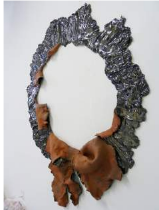
Brie Ruais, Inside Peeled Out , 132 lbs of Terracotta, 2013.

But in addition to that, the metallic surface refers to the fluid-like nature that clay has before it's fired, when it has the potential for continual transformation. Which is where the work is influenced by feminist theory and ideas about more fluid boundaries between gender.