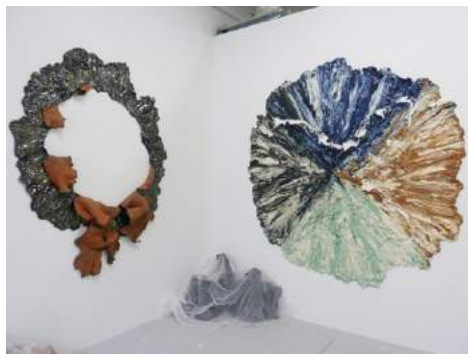
Two pieces in Brie Ruais' studio. September, 2013.

Cowansage, Corydon. "Interview with Brie Ruais," Art Haps.com , 27 October 2013.