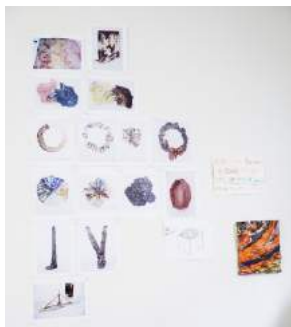
Preparatory photos in Brie Ruais' Studio in Sunset Park, Brooklyn. September, 2013.