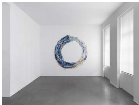
Brie Ruais, Circle Game (Push 350 pounds of clay in a circle until the end becomes the beginning and the color desaturates) , 2012.

Cowansage, Corydon. "Interview with Brie Ruais," Art Haps.com , 27 October 2013.