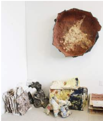
Disassembled pieces in Brie Ruais' studio, October 2013.

BR: Yes, the only intervention is cutting them into tiles or sections. Later I make decisions about the glazed surfaces. The colored pieces, however, are made with stained clay and the color is imbedded in the material, so make color decisions in advance.