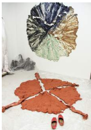
Brie Ruais, Four-Armed Compass (X Torn from two people's combined body weight in clay) , 2013.

For me, the work isn't about violence or aggression, it's about what happens when one's body is overcome by a physically demanding process. The actions seem aggressive, but they're also really basic. We are forced to remember that making something sometimes requires the laborious use of the body.