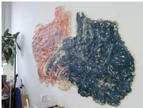
Brie Ruais, Movement from Outside to Inside (Threshold of Studio) , 2013.

BR: I arrived at cutting them into pieces because it would be impossible—even if I had a kiln the size of the work—to move such heavy, thin ceramics without them breaking. I've settled on the brick-like grid for the solid pieces, and radial cuts for the ring-shaped pieces.