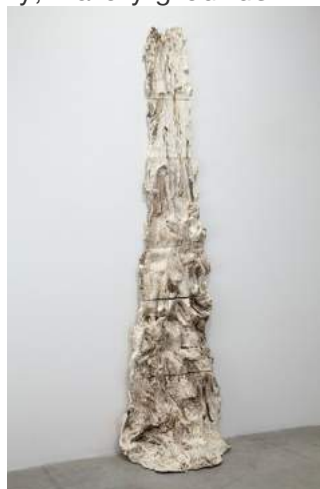
Brie Ruais, The Big Push #1 (250 Pounds of clay) , 2011.

BR: Yes, definitely. I like that imposition of a grid on something that's really gestural or "natural"—like the land. I'm reminded of Agnes Martin's grid paintings, where she laid a hand-painted grid over very brushy, watery grounds.