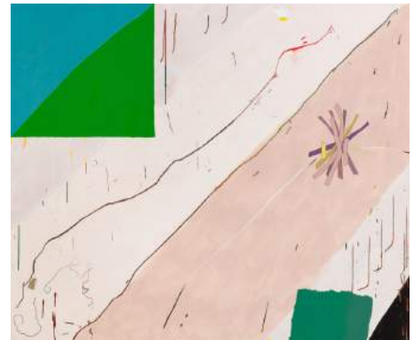
Allison Miller, Cream , 2018. Oil, acrylic, glitter and collage on canvas 73 × 87 in.

The other paintings on view observe rectangular decorum and more clearly reflect the assurance with which Miller consolidates her compositions and imbues them with strange feeling. Bury Arch is divided by an implicit horizon, but there are no supporting indications of depth. The dark lower field becomes a cutaway, revealing a subterranean realm that houses four irregular, burgeoning masses in which Miller's jacketed lines and arcing strokes are suspended like genetic material. We could be witnessing a process of germination—a painting nursery?—sheltered by a moist, stippled sky.