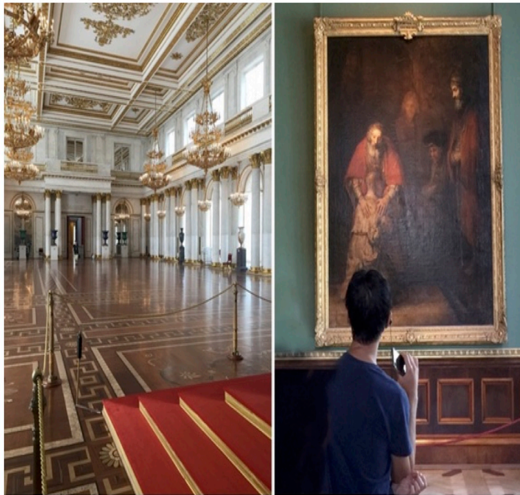
(L): Big Throne Room Winter Palace, St. Petersburg (R): "The Return of the Prodigal Son," Rembrandt van Rijn (1661-1669) Hermitage Museum, St. Petersburg