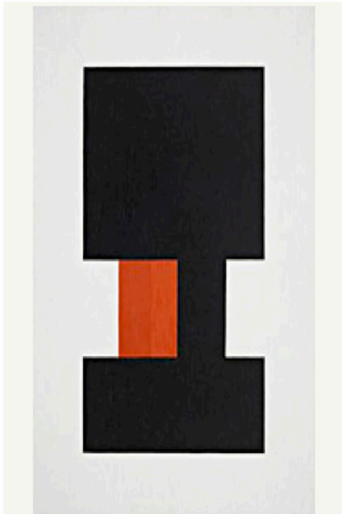
John McLaughlin L-1958 1958 Greenberg Van Doren Gallery